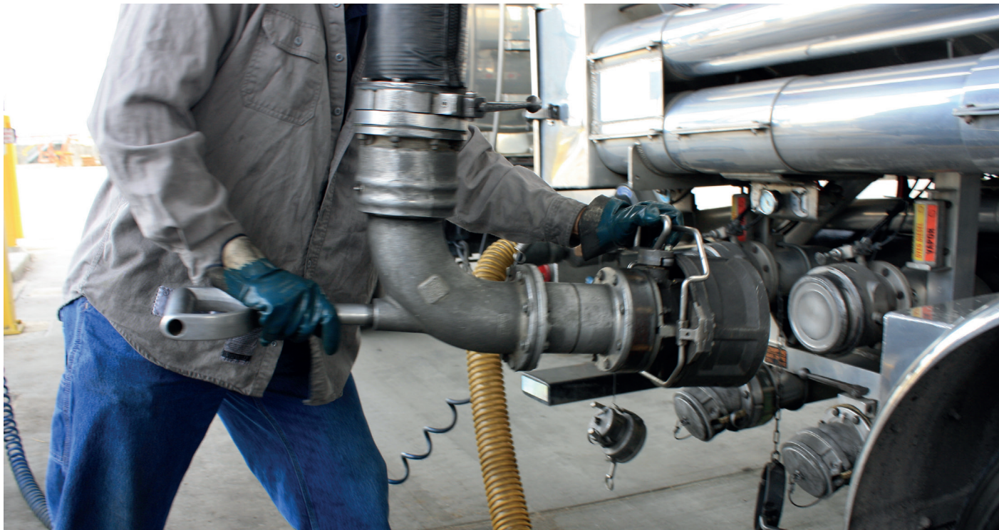
Before selecting an API bottom-loading coupler, terminal operators should consider several factors that can affect coupler performance