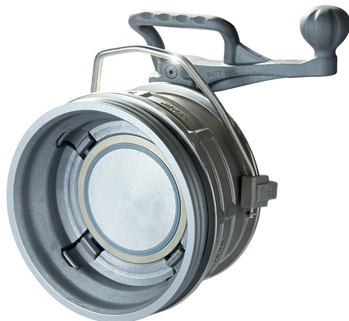
The Lynx API Bottom-Loading Coupler from OPW Engineered Systems has been designed to provide a superior and effortless bottom-loading experience

Most couplers are rated for use at 75 to 80 psi (5.2 to 5.5 bar), but they can experience much higher pressures if thermal reliefs are not in place and functioning properly. In fact, extreme thermal expansion can create pressures in excess of 300 to 500 psi (20.7 to 34.5 bar). At pressures this high, the coupler could be at risk of a catastrophic failure leading to extreme loss of product. If the technician is having difficulty opening or closing the coupler handle, this may be a sign of thermal-expansion issues.